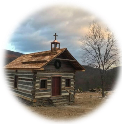
HERITAGE WOODWORK IN BROWNSBURG, VIRGINIA